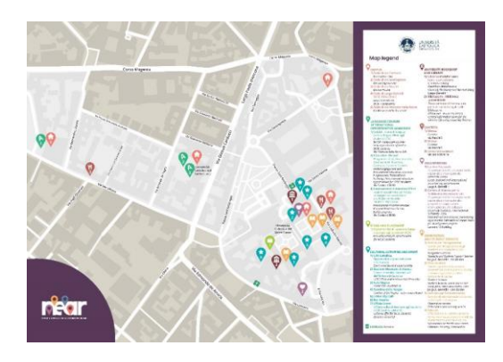
Università Cattolica del Sacro Cuore, Milan